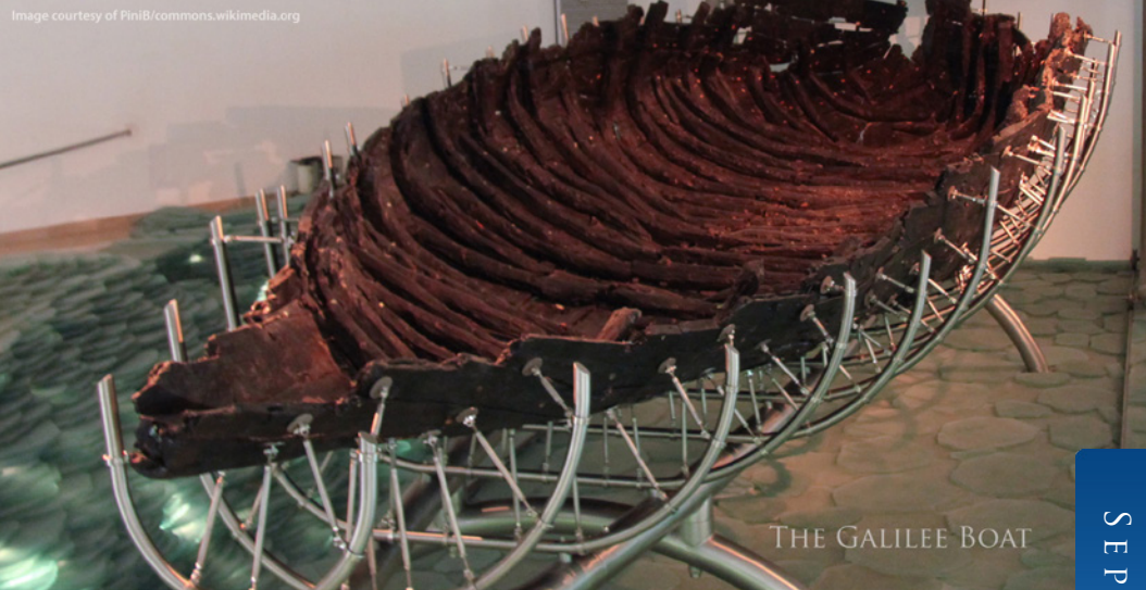
THE GALILEE BOAT

Therefore, my dear brothers, stand firm. Let nothing move you. Always give yourselves fully to the work of the Lord, because you know that your labor in the Lord is not in vain.